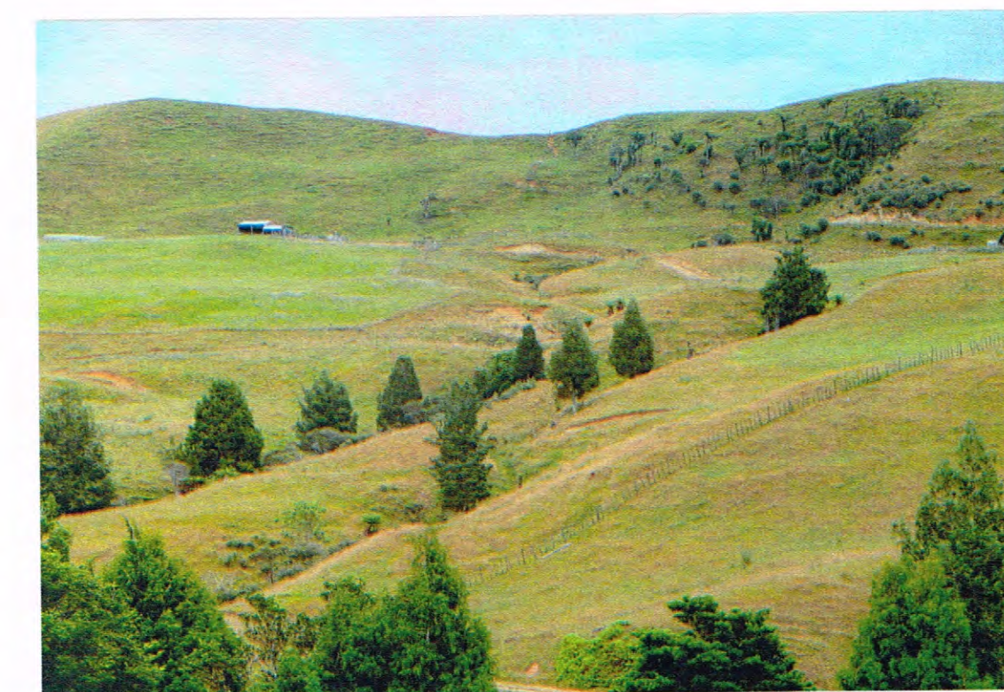
③ helps in preventing slips and soil erosion