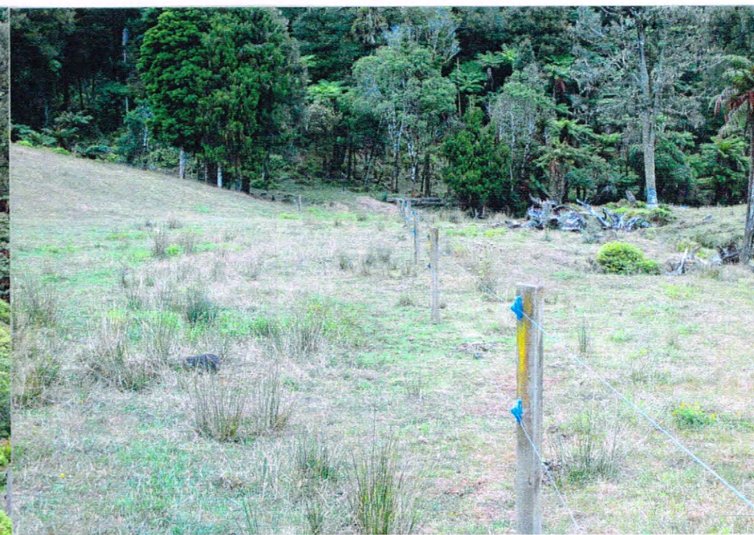
② due to fencing and natural terrain,