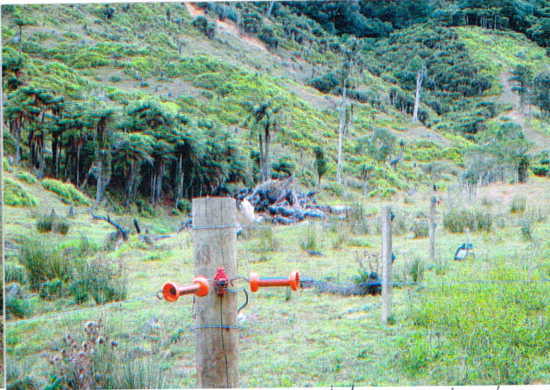
① Stock already have limited access to streams