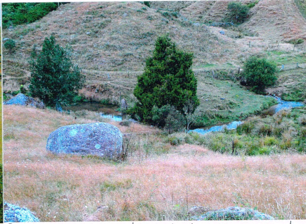
③ grazing keeps stream banks clear and stream unobstructed reducing water contamination with the use of harmful sprays