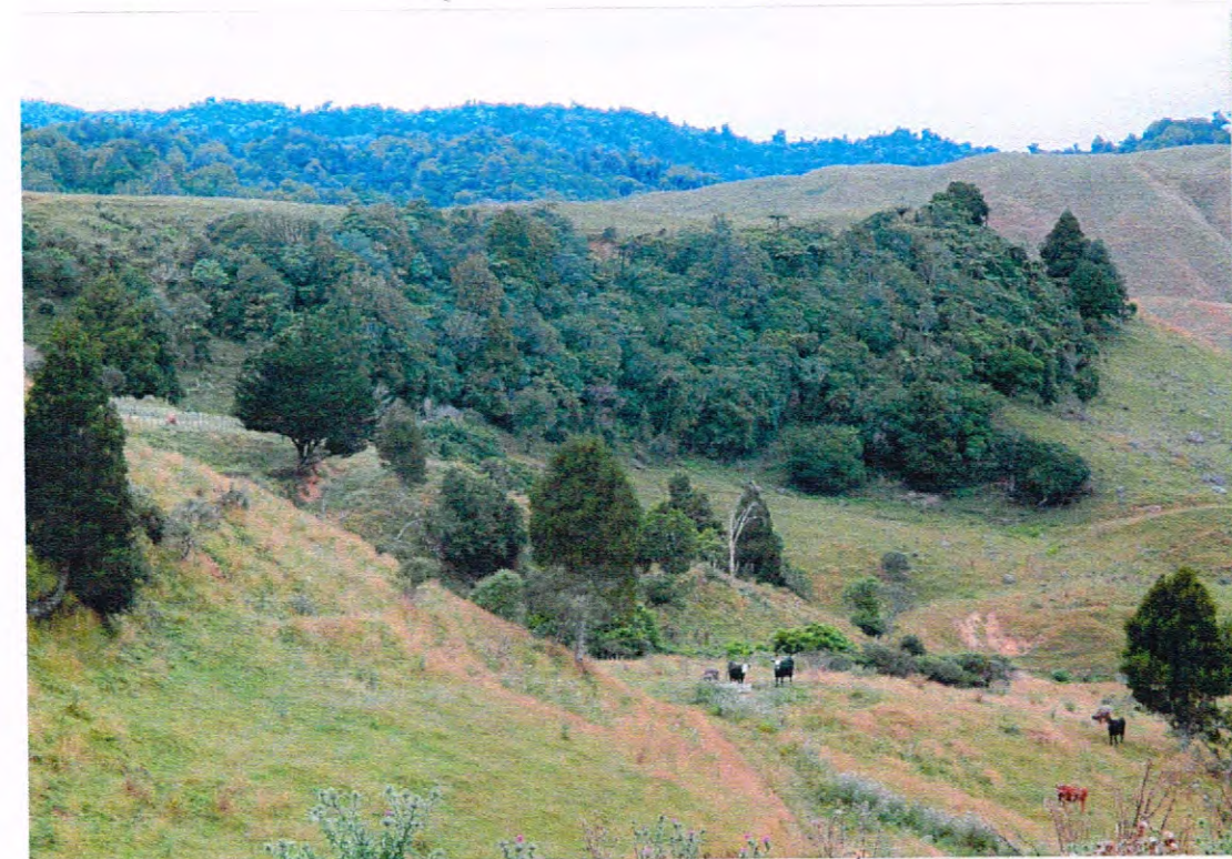
① Native bush left on steep slopes