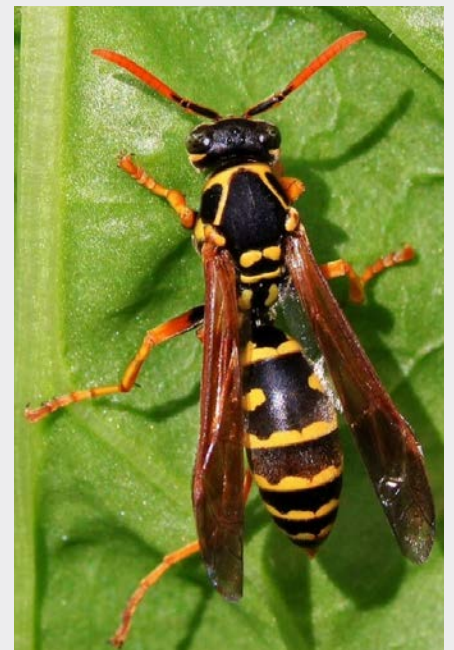
Asian Paper Wasp.