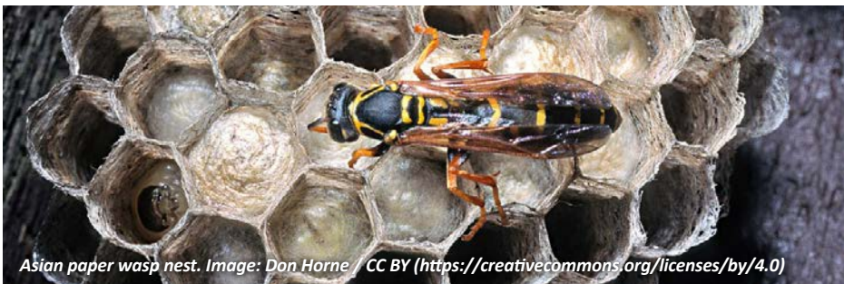
Asian paper wasp nest.

Spray the nest with household fly spray in the evening, when all the wasps are likely to be in the nest. The nest can then be removed by placing a bag under the nest, pulling it up over the nest and clipping the nest off into the bag. Seal and dispose of it in the rubbish or burn it.