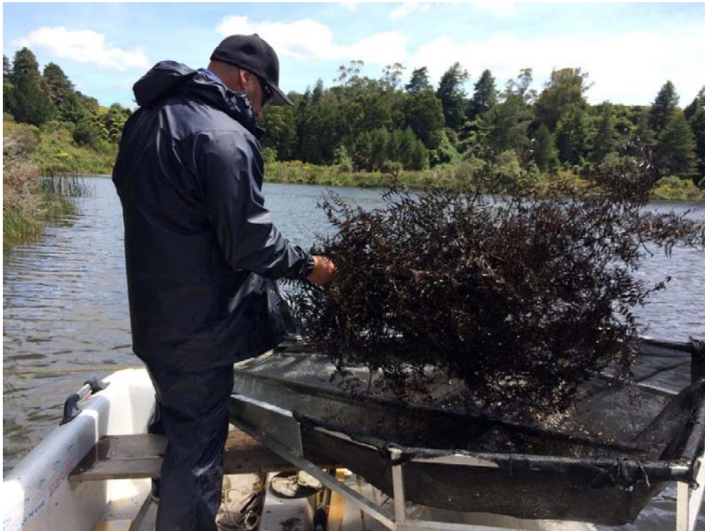
Figure 4 Retrieving tau kōura set in Lake Ngāpouri, 28 December 2016.