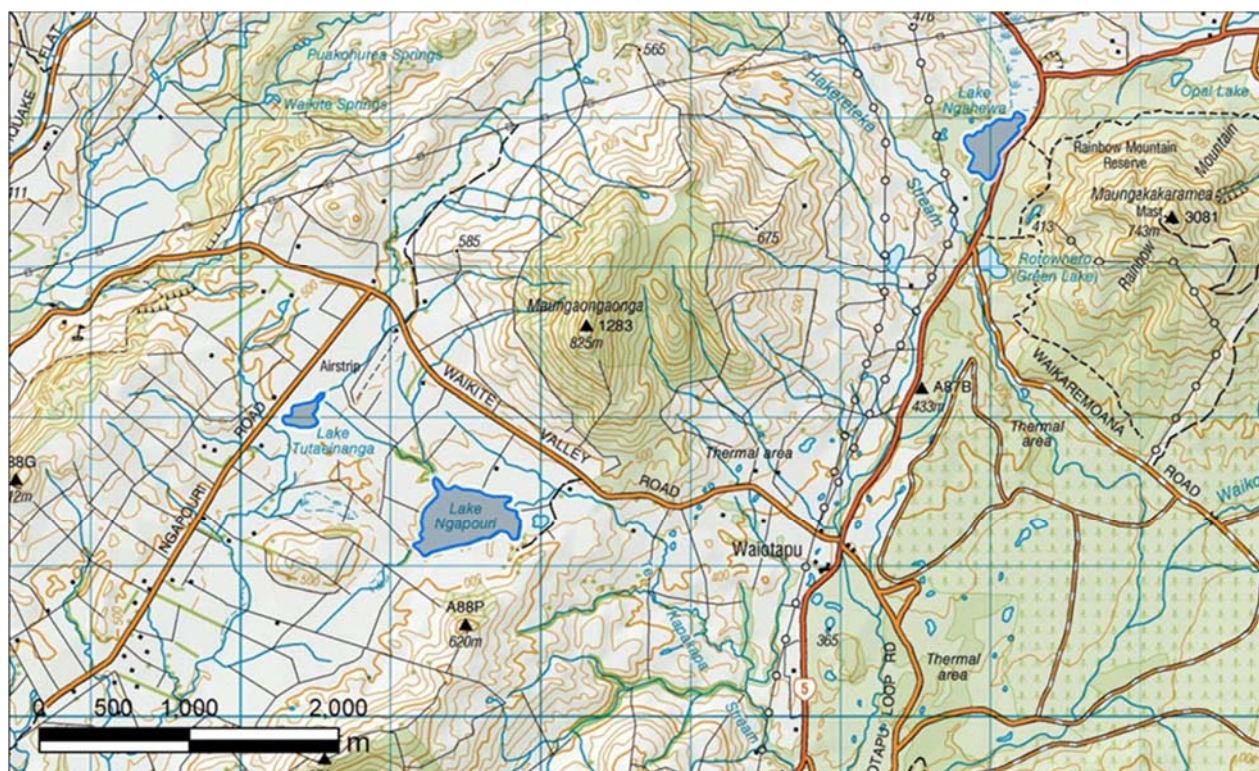
Figure 1 Map showing the location of lakes Ngāpouri, Ngāhewa and Tutaeinanga.

Total length (TL, mm) of each fish was measured using vernier calipers ( \pm 0.5 mm). After processing, all fish were returned to the water near the tau kōura. Catch Per Unit Effort (CPUE) was defined as the number of fish per whakaweku.