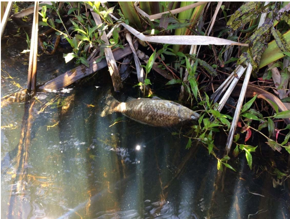
Figure 5 A large (TL = 280 mm), dead goldfish found floating in Lake Ngāhewa, 28 December 2016.