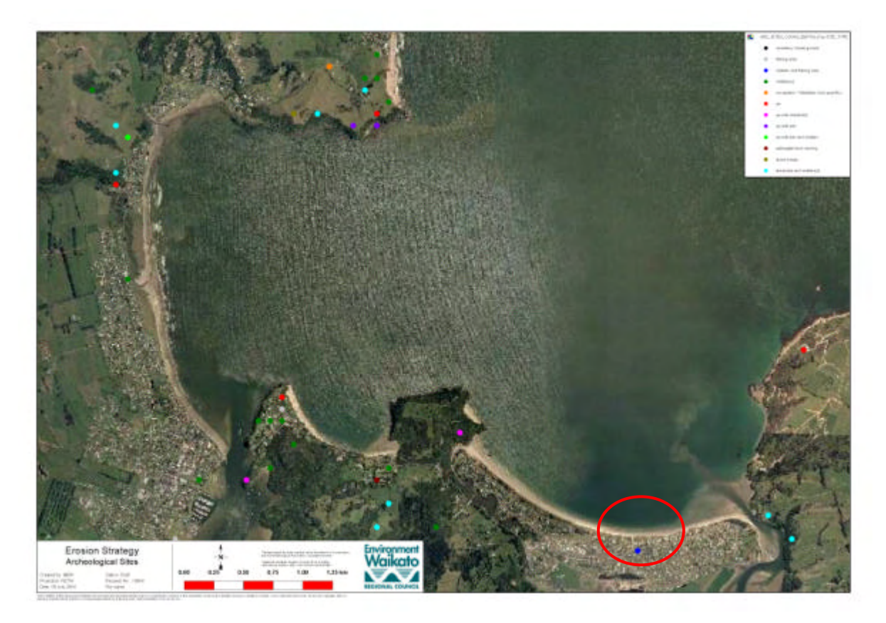
Figure 5: Archaeological sites for Whitianga and Cooks Beach held in EW register.