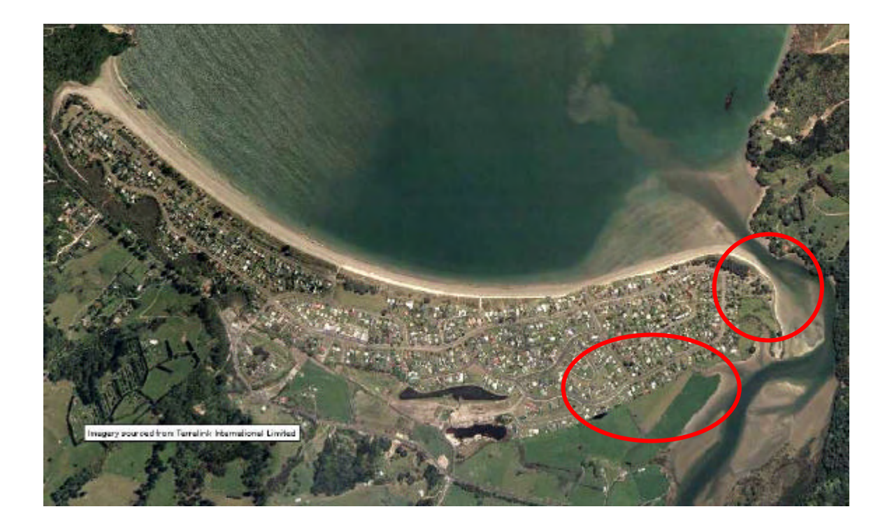
Figure 4: Two main areas where archaeological sites have been discovered at Cooks Beach

Overall it is considered that the frontal dunes of Cooks Beach are so dynamic that there are unlikely to be any remaining intact archaeological sites (Warren Gumbley, Regional Field Archaeologist, New Zealand Historic Places Trust, pers. comm. July 2004).