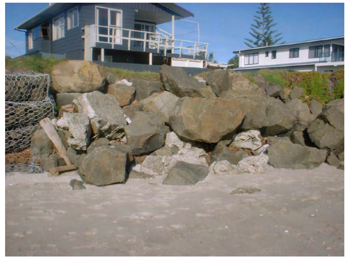
Figure 3: Cooks Beach property currently protected by a rock wall.

There are potential liability issues for management agencies and property owners in regard to these structures.