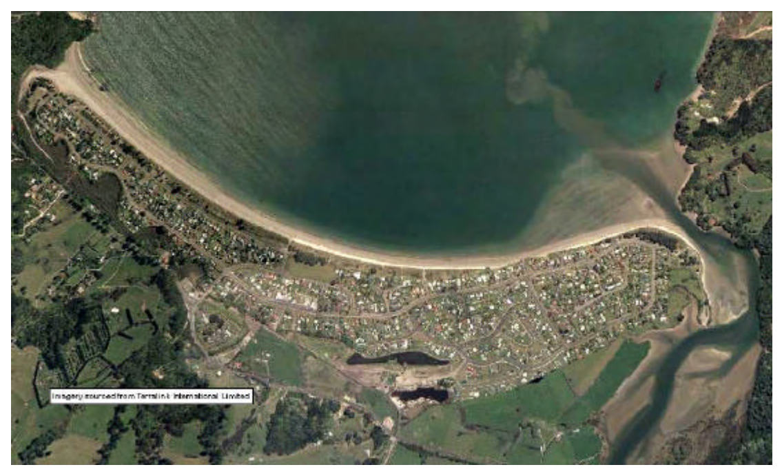
Figure 1: Cooks Beach showing Purangi Estuary to the east. Note the ebb tidal delta.

The beach has formed over the last 6500 years; largely from sands moved onshore from the adjacent continental shelf (Dahm and Munro, 2002). Shoreline advance over this period has formed a coastal dune plain, varying in width from 200m (western end) to 675m (eastern end). However, <u>net</u> seaward advance has progressively slowed over the last 2000-3000 years and has now effectively ceased (Dahm and Munro, 2002). In simple terms, the beach effectively has all the sand it is likely to get.